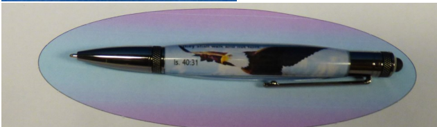
Cortona with stylus - Gun Metal Clear Acrylic with Is. 40:31