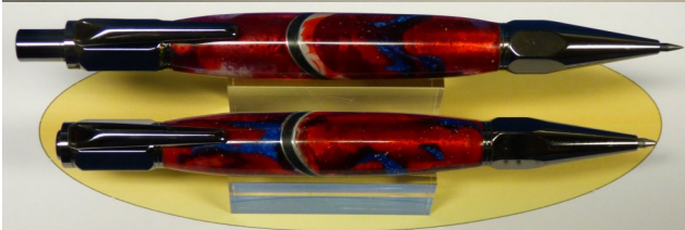
Vertex Click Pen & Pencil set - Gun Metal with Silver & Black Inlay